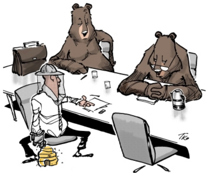
“Gentlemen, I’ve been authorized to sweeten the offer.”