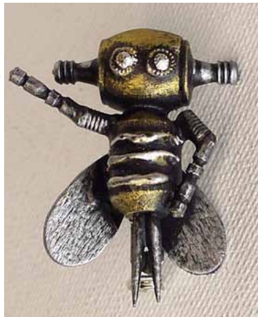
"Take me to your feeder!"